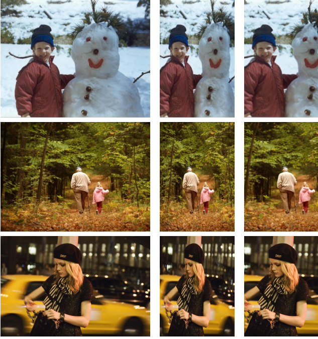
Fig. 3: Left: reference images; middle: retargeted images by multi-operator retargeting [14]; right: retargeted images by the proposed method.

our previous model in compressed domain [13], while the top-down saliency map S_t is estimated by a face detector [22]. Of course, other top-down factors can be also integrated into the proposed method. The linear combination method is used to combine the bottom-up and top-down saliency map to obtain the final saliency map for images as: