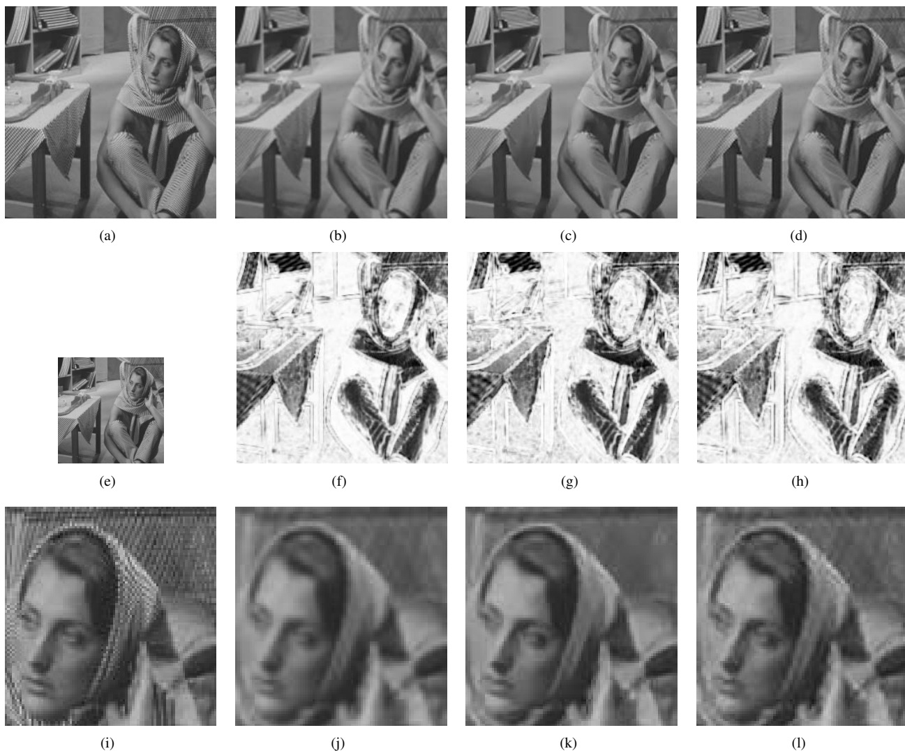
Fig. 2. Original Barbara image (subplot (a)), its low-resolution version (subplot (e)), high-resolution images reconstructed by (subplot (b)) Bicubic, (subplot (c)) Yang et. al., (subplot (d)) proposed method, the corresponding SSIM maps (subplots (f-h)), and enlarged region (subplots (i-l)).